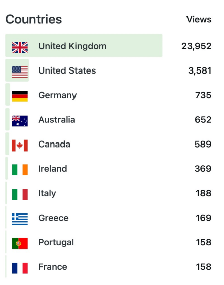
Top 10 Countries by Views - 2022