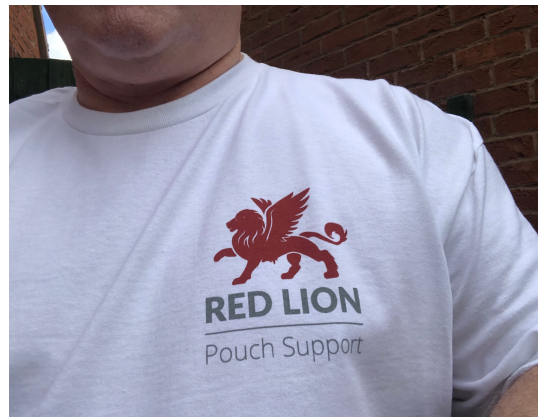
RLG AGM 2023